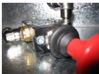
Valves with fittings and silencer