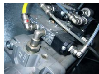
Cylinder/Valve combinations and accessories

Recurrent series of pneumatic products (with a lot of possible combinations) can be pre-assembled on customer specifications.