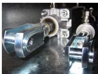
Cylinders with accessories