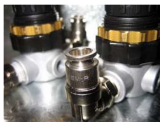
FRL with fittings and mounting accessories